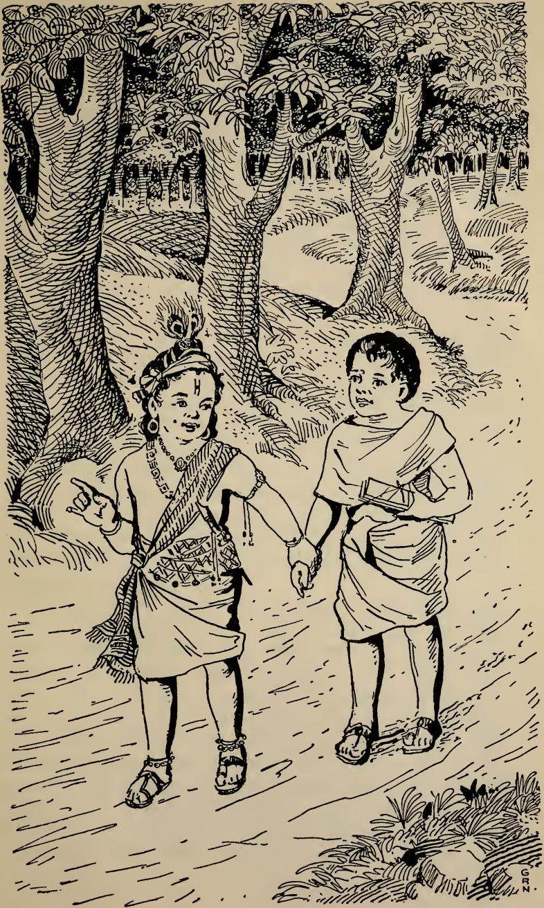
THE FAITH OF A CHILD